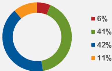
Number of events: 1,060